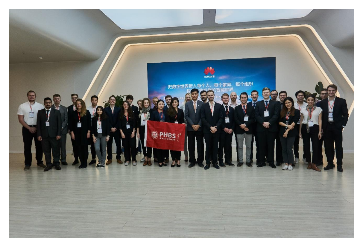
Picture 1: International Students visiting Huawei's headquaters in Shenzhen