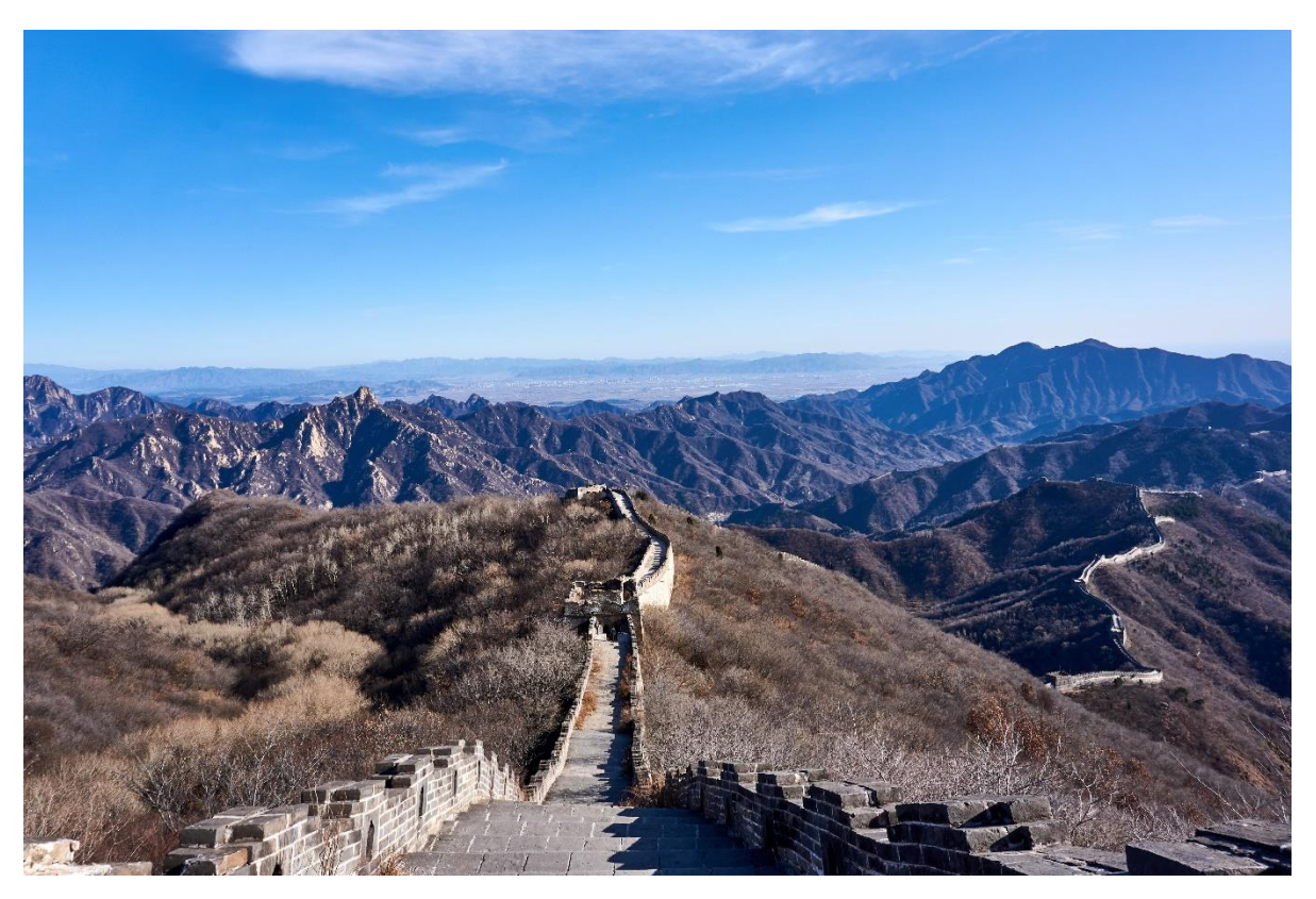
Picture 5: The Great Wall of China - one of the things you can see when studying abroad in China