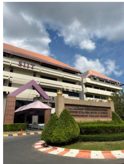
University SIIT in Rangsit