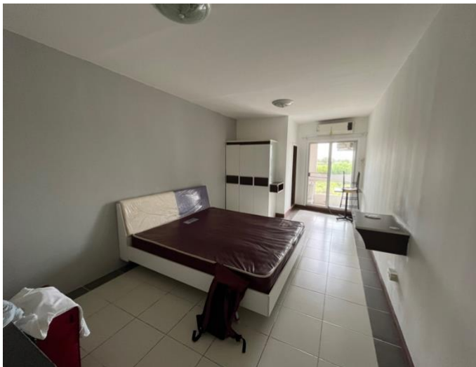
Room in Golf View

I would definitely take a cooking course! It is so delicious and you learn a lot, it costs around 30 euros but in my opinion worth it. If you like museums, I enjoyed the museum of contemporary Art in Bangkok a lot. Many museums and temples are free or cheaper for students, so always take your student card with you. I also recommend visiting the historic city of Ayutthaya as it is not too far away from campus and very famous and plays an important role in the history of Thailand. In Bangkok I can recommend visiting Bang Kachao, as it is more calm with a great park and more nature than inside the busy city. You can rent a bike and cycle through the area. Of course the national parks and islands are stunning to visit as well.